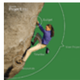
MS-Project 2010 Family