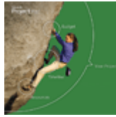
MS-Project 2010 Family